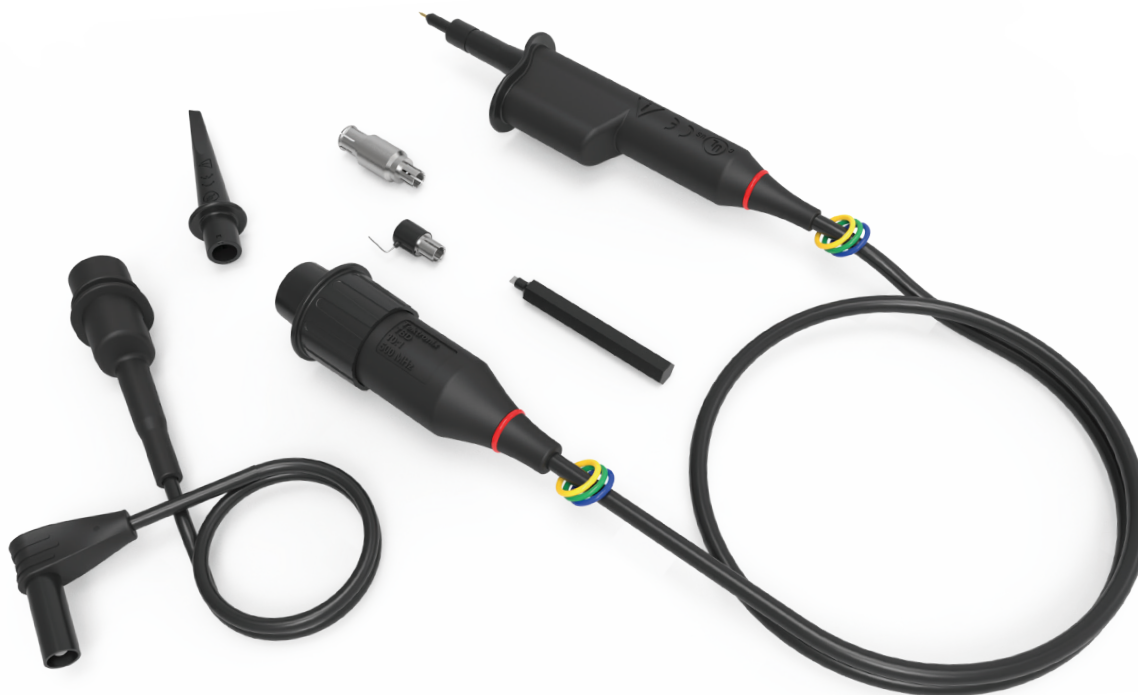
Passive Probe HTP500