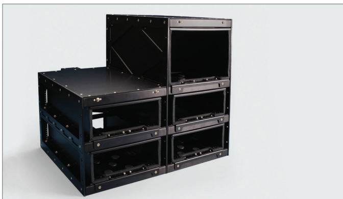
Modular VIP racks accommodate vertical and horizontal stacking, making for a wide variety of installation options.