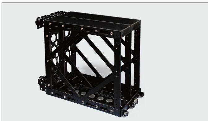
Unique low-profile hold-downs have minimal protrusion, maximizing installed space utilization and reducing the potential for contact in galley and cabin areas.

The Modular VIP Aircraft Racking system is a unique avionics and electronic component support system that offers all the design capabilities of a custom installation, while maintaining maximum flexibility for future integration with minimal reconfiguration.