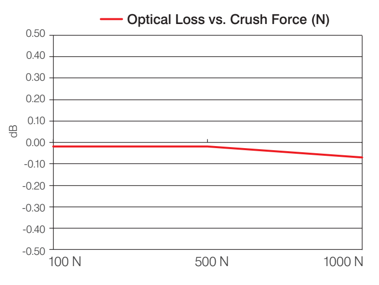
N = Newton