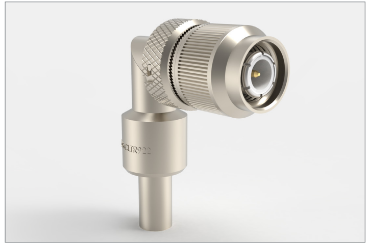
90° Angle Option