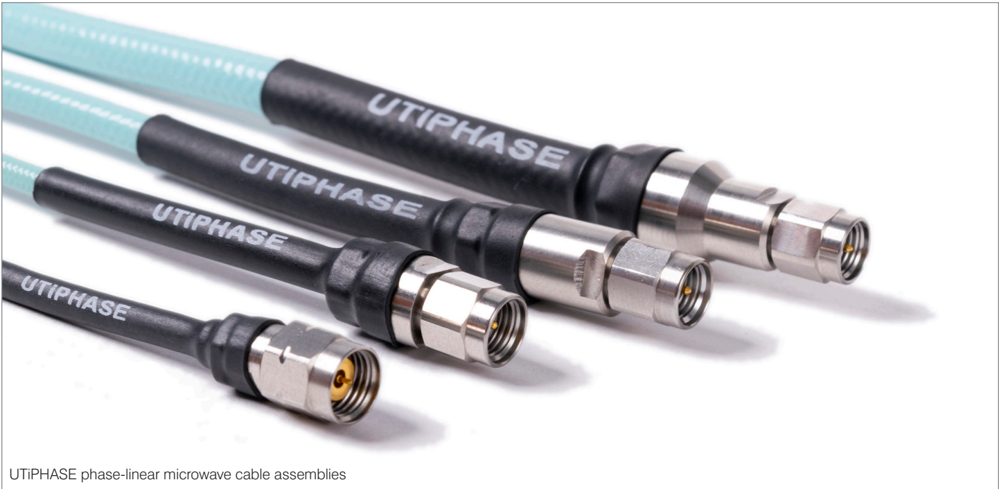
UTiPHASE phase-linear microwave cable assemblies

This testing represents the minimum required to certify UTiPHASE for use. Additional tests or more aggressive regimens may be applicable for specific defense and space-rated applications. Please contact CarlisleIT for more information.