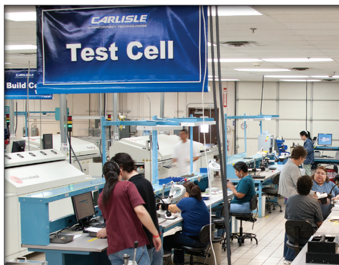
Burn-in, thermal shock and thermal cycle testing available in-house