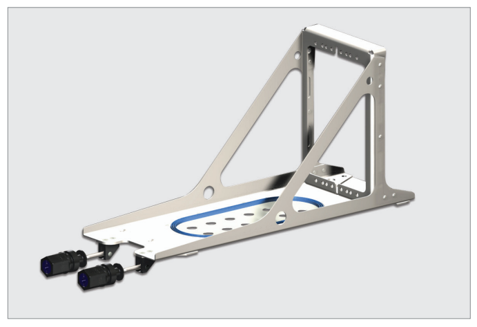
Lightweight Tray with Insertion-Extraction Hold-Downs