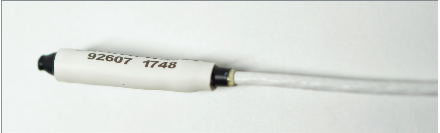
120Ω Lightweight CANbus Terminator

The extruded outer jacket strips easily, simplifying termination while the small diameters and short cap lengths simplify harnesses routing through tight spaces on the aircraft.