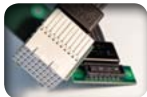
HDSI® Miniature Ribbonized Coax or Differential Pair Assemblies for High Speed and High Density