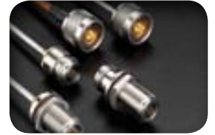
General Purpose Assemblies and Harnesses