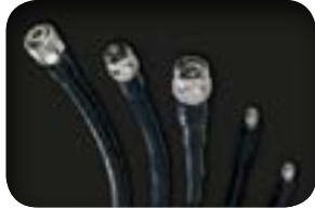
Ruggedized/Armored WorkHorse® Test Cables