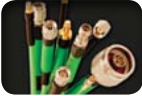
Low Loss Phase Stable Flexible Coax Assemblies