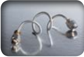
Semi-Flex®/Conformable Coax Assemblies