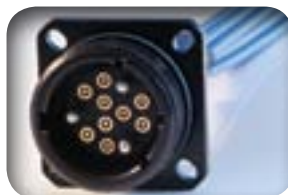
HDRFI® High Density Coax Connector Packaging System

CarlisleIT offers Test & Measurement solutions specially designed for RF/Microwave and high speed analog and digital equipment including multimeters, oscilloscopes, digital analyzers, logic analyzers, network analyzers, semiconductor test equipment, and more.