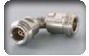
In Series and Between Series Adapters