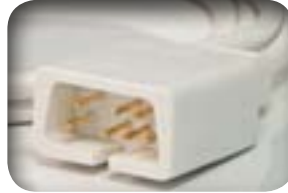
Molding & Potting Services for Custom Solutions