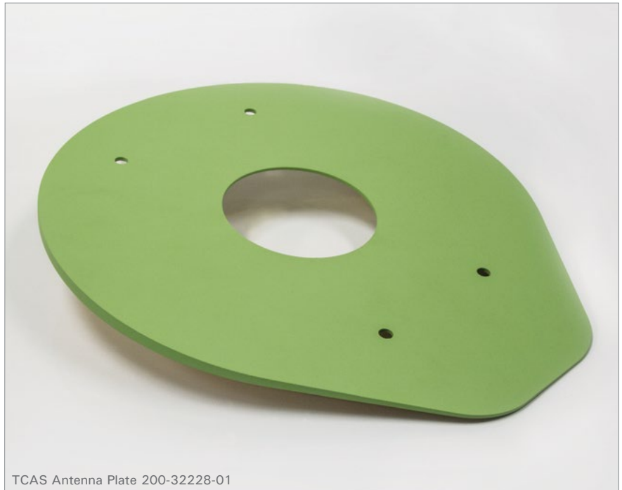
TCAS Antenna Plate 200-32228-01