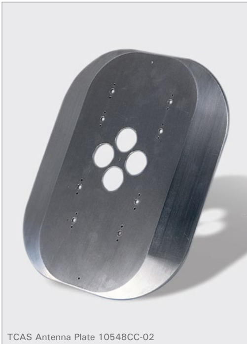
TCAS Antenna Plate 10548CC-02