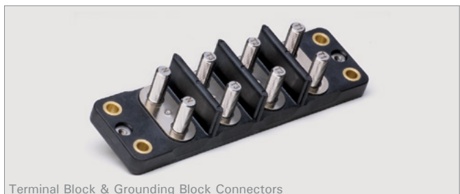
Terminal Block & Grounding Block Connectors

The CSLT is a quick coupling connector which can be used with PC tail and solder cup contacts in the receptacle and standard AS39029 size 20 contacts in the plug. Also this connector can be polarized in six different positions. The bayonet post design on this quick coupling connector is just an example of the capabilities we have available for your custom interconnect solutions.