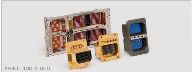
ARINC 400 & 600

Our ARINC connector capabilities range from standard to complex with custom inserts, filtering, and harnessing options available – we do it all. Please contact our Tempe, AZ (Phone #: 480-730-5700) facility for filtering information.