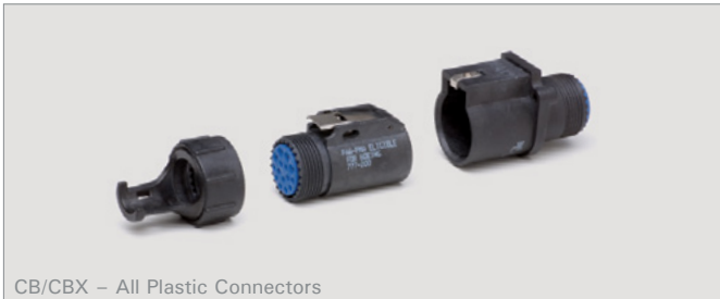
CB/CBX – All Plastic Connectors

The CQ connector's unique design emits an audible click when mated. It is ideal for blind mating applications and hard-to-reach places, such as under passenger seats. It mates with any standard D-Subminiature or MIL-C-24308 connector, when lockpost hardware is installed.