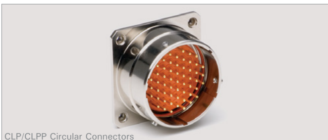
CLP/CLPP Circular Connectors

Our CBC/Galley Connectors are used by the airframe OEMs and the suppliers of galleys and galley insert modules. They have been standardized for ease of maintenance and interchangeability and are designed to accommodate the many different plug-in warming devices and other ancillary units presently in use world-wide.