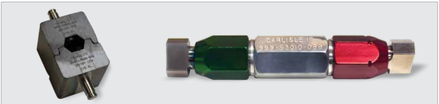
Crimp gauge and die