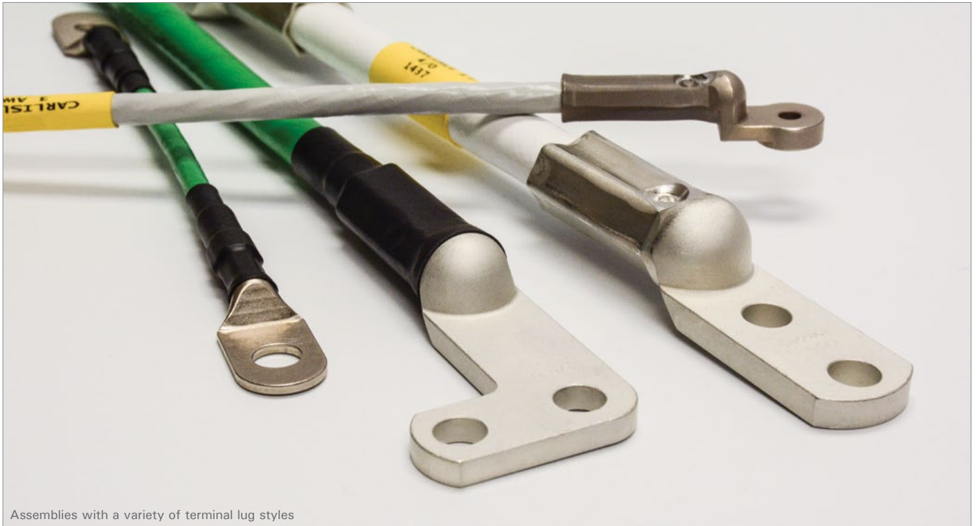
Assemblies with a variety of terminal lug styles