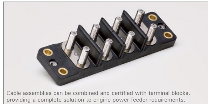
Cable assemblies can be combined and certified with terminal blocks, providing a complete solution to engine power feeder requirements.