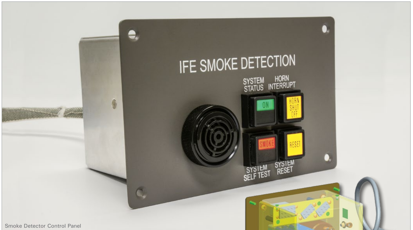
Smoke Detector Control Panel