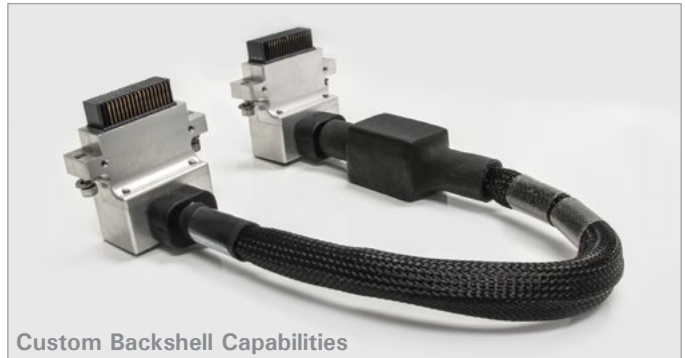
Custom Backshell Capabilities