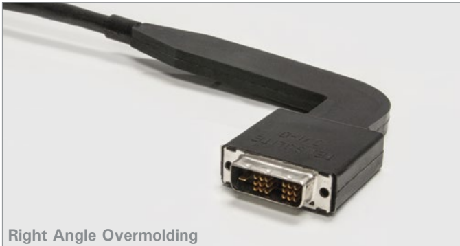
Right Angle Overmolding