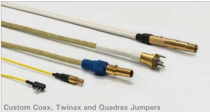
Custom Coax, Twinax and Quadrax Jumpers