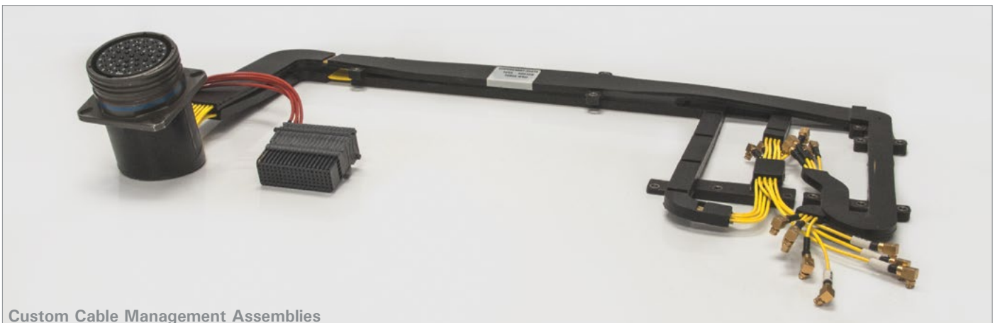
Custom Cable Management Assemblies