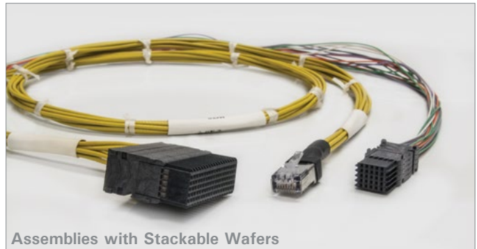
Assemblies with Stackable Wafers