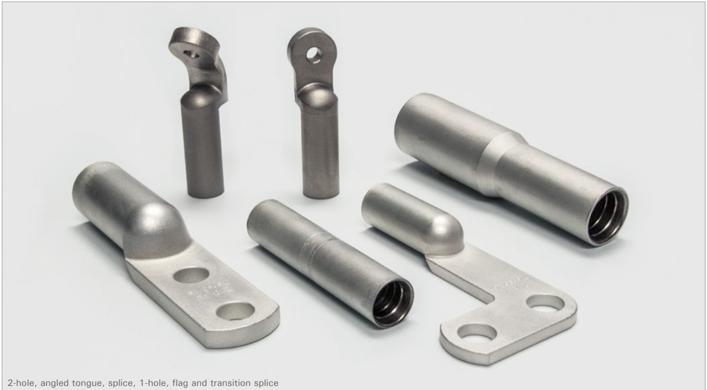
2-hole, angled tongue, splice, 1-hole, flag and transition splice