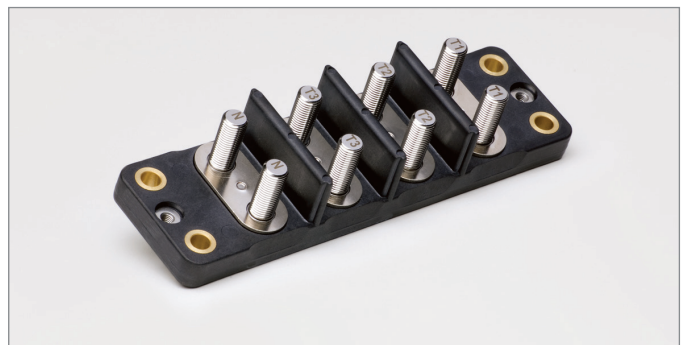
Cable assemblies can be combined and certified with terminal blocks, providing a complete solution to engine power feeder requirements.